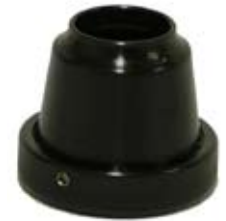
Short Track 5x5 Front