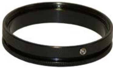
Short Track 5x5 Rear