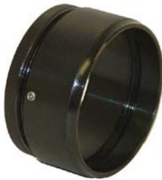
2 7/8" Bearing Wide Five