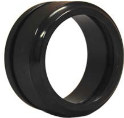
CUP Style Rear