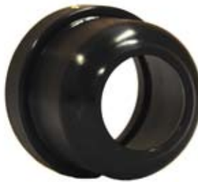
CUP Style Front