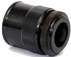
GM #2 Spindle