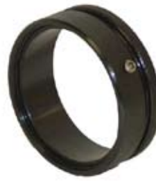
2" Bearing 5x5