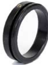
Sprint Car Front