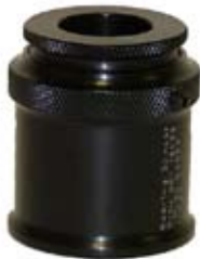
Canadian Tire Series Front